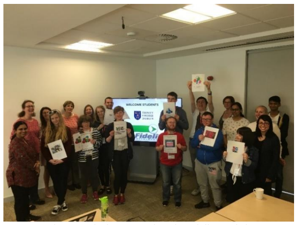
TCPID students with their completed IT Skills workshop posters

Thank you to Linda Devenney and a full team of Fidelity volunteers who worked with our 1<sup>st</sup> year students to help develop their IT Skills. The day in Fidelity also included a visit to the Virtual Reality Lab which was a huge highlight for the students!