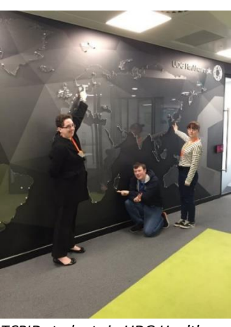
TCPID students in UDG Healthcare