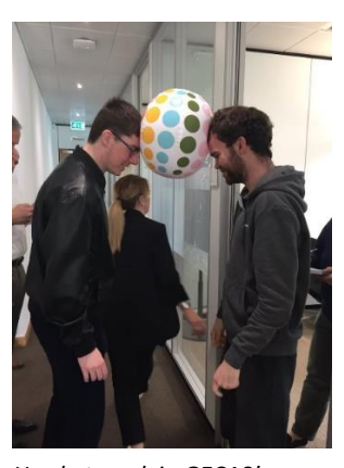
Hard at work in GECAS!