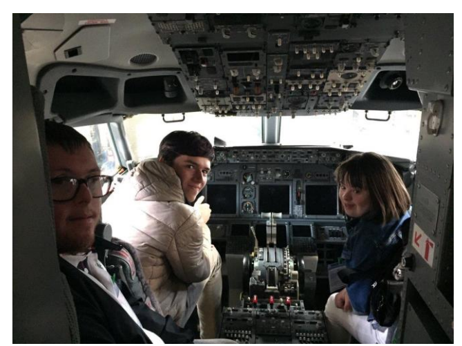
Pilots for a Day!