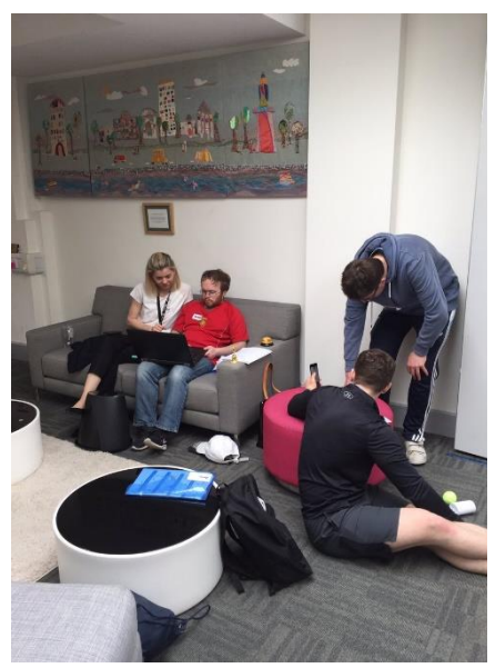
Students & mentors in Abbott Cherrywood SciFest project work in the TCPID