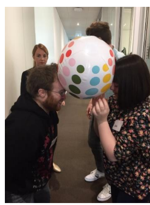
Hard at work in GECAS!