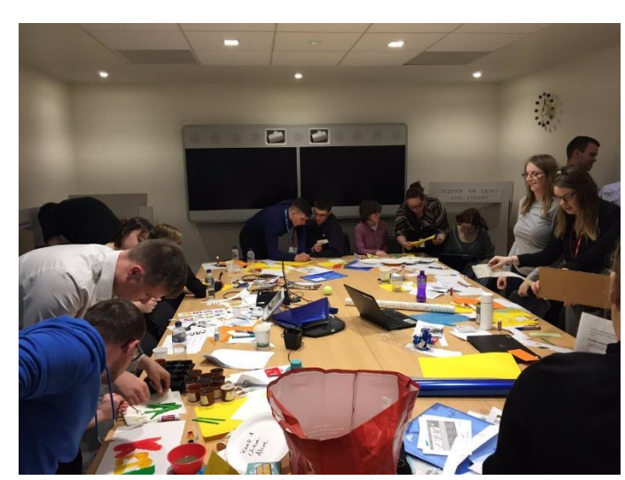
Students & mentors in Abbott Cherrywood

The SciFest@TCPID 2019 exhibitors and project titles were as follows: