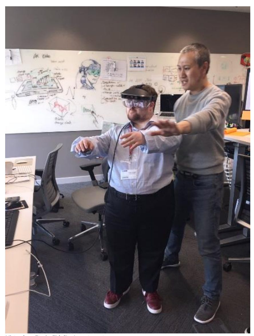
Virtual reality in Fidelity Investments