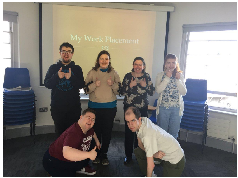
Our 2<sup>nd</sup> year students after completing their last TCD assignment

Our 1<sup>st</sup> year students successfully completed their second semester, studying modules including Emergency and Disaster Management, Application of Numbers, Poetry, Applied Health Sciences, Occupational Therapy and Exploring Art. We are looking forward to having them back with us in September to start 2<sup>nd</sup> year.