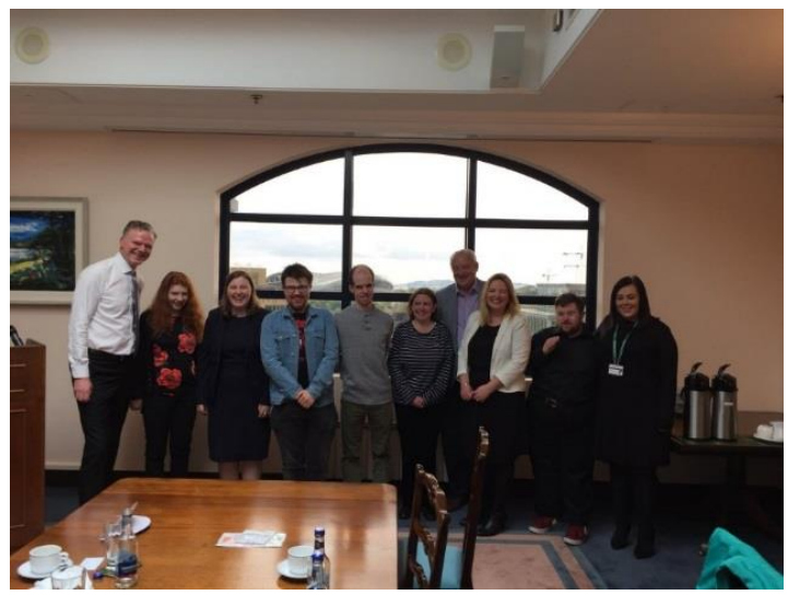
Students and staff with the NTMA team