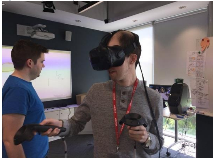
Virtual reality in Fidelity Investments