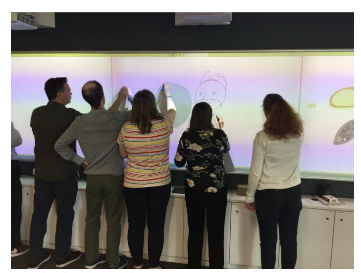
Virtual reality lab in Fidelity Investments