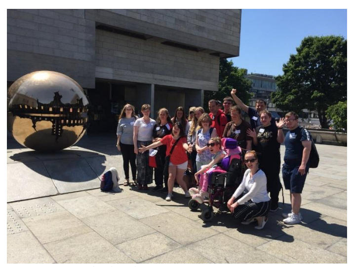
TCPID Summer School students