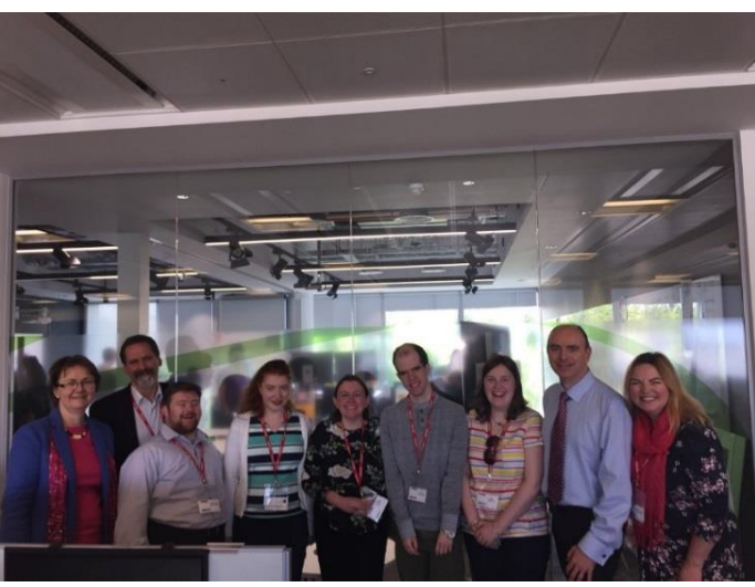
Students and staff with the Fidelity Investments team