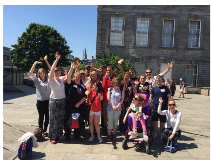
Happy faces in the Trinity College Dublin sunshine at the end of our Summer School

The Summer School was a huge success and we are already looking forward to doing it again in 2019!