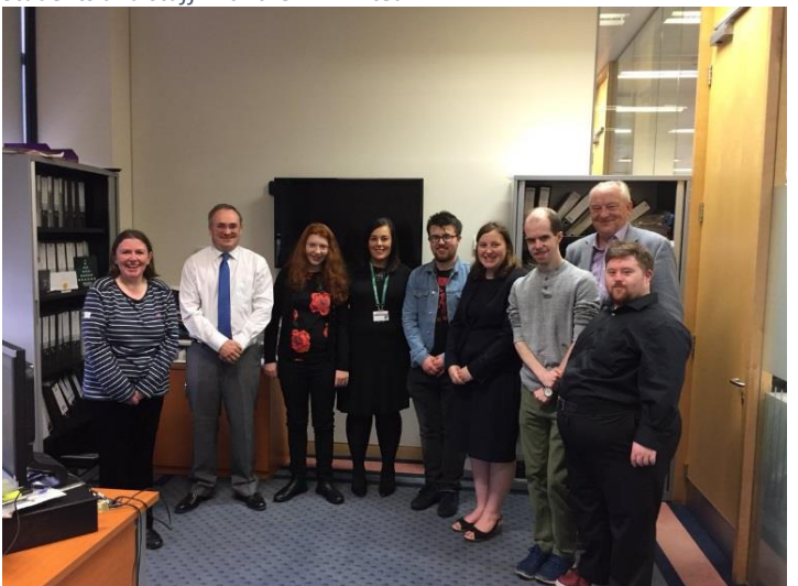
Students and staff visiting NAMA as part of the NTMA workshop