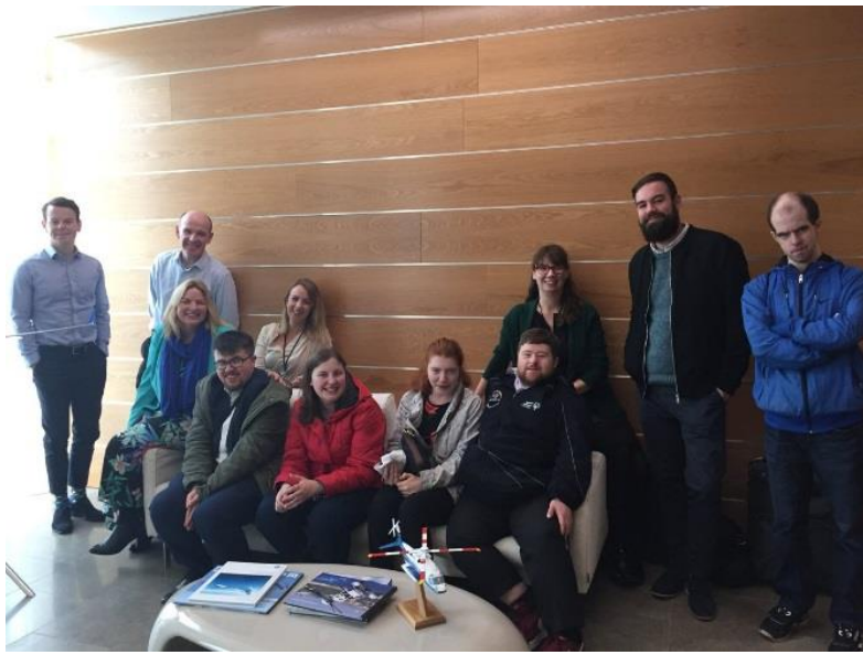
TCPID students and staff with the GE Capital Aviation Services team

We were thrilled to have so many fantastic workshops on offer for our students. Each company put together a wonderful agenda which included the opportunity to meet with a large number of the team. We are already looking forward to our next Business Partner workshops in May 2019.