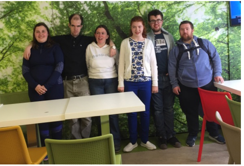
Our ASIAP students, ready to move to Year 2 of their course

Your help means that our students are already gaining a real insight into what they need to do in order to develop their careers. Many great opportunities are starting to open up for our students and graduates thanks to all of you.