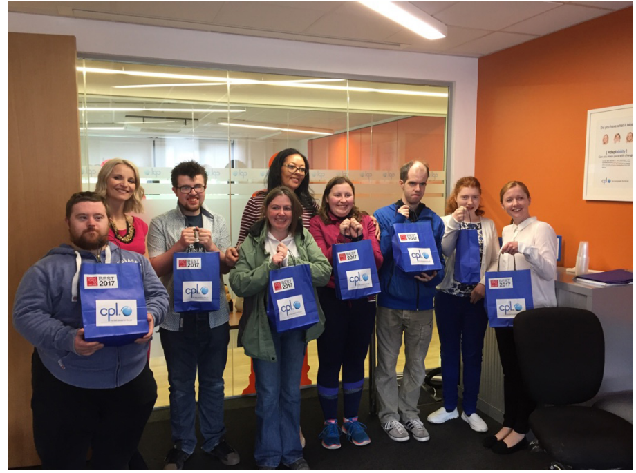
Goody Bags from CPL Resources

All of these workshops were held onsite in each company's office, which meant that our students were able to experience being in an office environment, as well as taking part in training. This was a huge learning experience and the students all grew so much in confidence by taking part. We hope to run these workshops for our Year 1 students every year from now on with the cooperation of the companies involved. We also hope to work together with you to look at developing some similar workshops for our Year 2 students, as they transition from Trinity College into employment or further education.