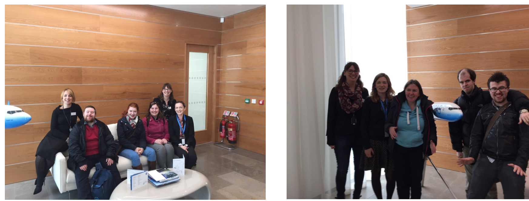
Our students enjoying their Administration Skills Workshop in GE Capital Aviation Services