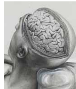
Drawing, from a photograph, of an exposed brain, by medical artist S.Sewell. Early 20th century. TCD MUN MED 24