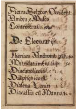
List of medicines prepared by an apothecary. Late 17th century. Italian and Latin. TCD MS 11187 folio 3r