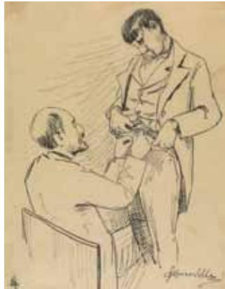
Sketch by Edith Somerville (1858–1959) of a patient receiving treatment at the Pasteur anti-rabies clinic in Paris in 1886. TCD MS 4274b/4