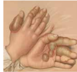
J. Hutchinson Illustrations of Clinical Surgery (London 1878-88)

Dentistry was originally undertaken by self-taught practitioners and by those who underwent an apprenticeship in the Guild of Barber-Surgeons until the dissolution of that body in the 1840s. The first Dublin Dental Hospital opened in 1876 to provide treatment for the poor and training for students. A number of Trinity men were associated with it from its foundation, such as Samuel Haughton (1821-97),