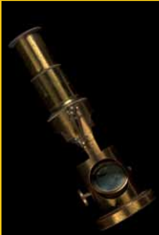
19th-century microscope from the Meath Hospital.