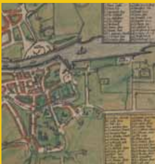
Detail of Dublin city, showing the College and Trinity Hall, from a map of Leinster by John Speed (1552–1629), 1610. TCD MS 1209/7