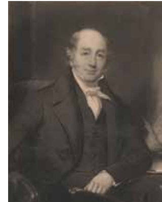
Portrait of surgeon Abraham Colles (1773-1843). Print. TCD MS 4726/13

People who were considered to be lunatics were harshly treated, often to the point of being tortured. Terrorising the patients was believed by some practitioners to be effective, as was extreme physical agitation. It was not until the 19th century that serious efforts were made to move towards more humane treatments. Jonathan Swift (1667-1745) made several unsuccessful attempts to establish a hospital for the insane poor during his lifetime. Ireland's first hospital for the insane, St Patrick's, was founded with Swift's bequest, in 1757.