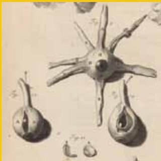
G. Bidloo, Anatomia Humani Corporis (Amsterdam 1685)