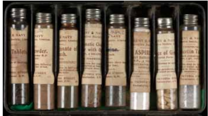
Portable medical supplies. Early 20th century. TCD MS 11326