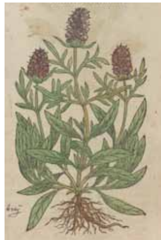
John Gerard, Great Herball, or Generall Historie of Plantes (London 1797), p 507

College of Surgeons which was founded in 1784. In 1805 there were 35 students in the Medical School, only five of whom were studying practical anatomy.