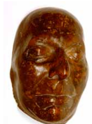
Death mask of Jonathan Swift (1667-1745) dean of St Patrick's Cathedral and author. TCD Misc Objects Swift death mask

registrar of the medical faculty in Trinity College, who served on the governing committee. In 1889, the hospital moved from York Street to its present home in Lincoln Place, behind Trinity College. In 1909 the College established a teaching school of dentistry.