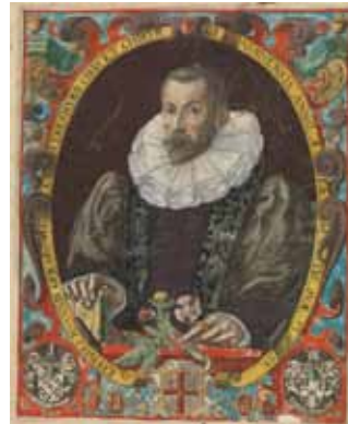
John Gerard, Great Herball, or Generall Historie of Plantes (London 1797). Frontispiece showing the author holding the potato plant. Gerard was the first to describe this plant in English