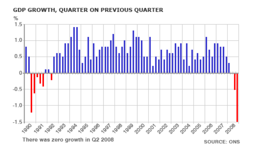
Figure 1: GDP growth in UK

in the second; and the UK was declared to be in recession in January 2009 (see Figure 1). The idea behind two consecutive quarters is supposed to ensure that statistical aberrations or onetime events cannot create a recession; for a recession to occur, the real economy (production and consumption of goods and services) must decline. However, this definition is becoming increasingly unpopular due to several identified issues. The Economist recently published an article advocating the need to fundamentally redefine the term 'recession.' In fact, the definition of two negative quarters came about only as a result of a 1974 article written by Julius Shiskin, in which he included a list of factors for spotting a recession. For some reason, the particular idea of two negative quarters of GDP growth was seized upon and became the standard norm, but it is simply too narrow a rule.